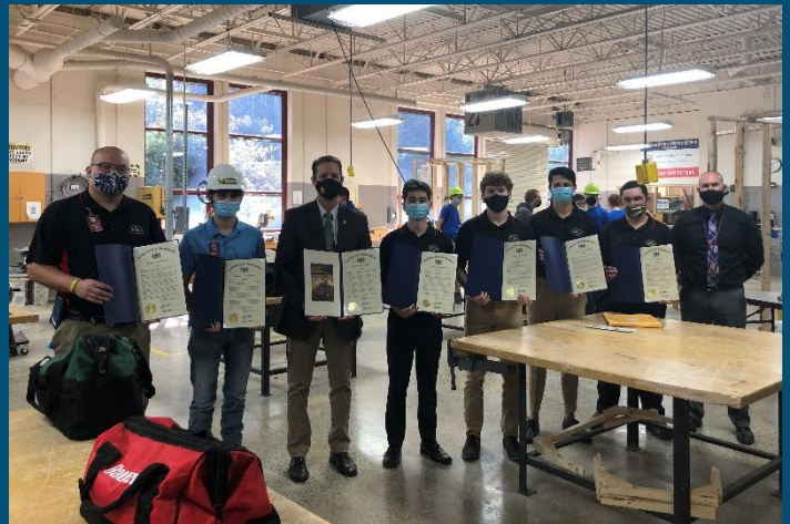
National Champions of the Residential Construction Management Competition at A.W. Beattie Career Center are awarded by Rep. Mercuri

Despite the headwinds of a post pandemic country, as of September, the unemployment rate in our District is 2.1%. This is compared to 6.1% for Allegheny County, 6.2% for Pennsylvania, and 4.8% for the U.S. These numbers are all down relative to the high points that were seen during the early months of the COVID-19 pandemic.