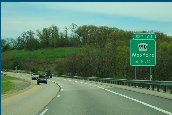
The interchange at I-79 and SR-910, that is vital to our community, is finally getting the needed funding to renovate

The Wexford interchange of Interstate 79 and State Route 910 that needs millions of dollars' worth of work to improve the safety and flow of traffic in Marshall Township and Franklin Park Borough is in the planning process to be approved for federal funding. This area of our community has had an increased amount of traffic over recent years due to the population growth in the area compounded with commercial development in the surrounding area. This exit off I-79 supports traffic towards Marshall Township, Franklin Park Borough, and the Town of McCandless and has been overburdened by commuters twice a day during the morning and afternoon rush hours. This long-term project for PennDOT will greatly assist our growing community's transportation needs in the years to come. Be on the lookout for community meetings for this project starting next year!