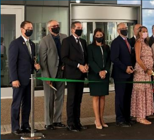
Rep. Mercuri helping to open AHN Wexford hospital at their ribbon cutting ceremony in September

Within our district, our residents have a median per capita income of $65,180 and a median household income of $124,375. The median per capita income is $38,709 in Allegheny County, $34,352 in PA, and $34,103 in the U.S. The median household income in Allegheny County is $61,043, $61,744 in PA, and $62,843 in the U.S.