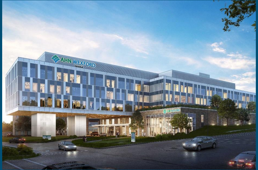
A rendering of the recently opened AHN Wexford Hospital that is home to the state-of-the-art facility with 160 beds with room to grow

As part of our growing population here within our district, AHN opened its newest hospital on September 30 th . This brand new facility on Perry Highway in Wexford is a state-of-the-art facility that will offer residents some of the most advanced care without having to travel great distances. The new hospital has a labor and delivery unit with a level two NICU, an Emergency Room with 24 beds, and special care for pediatric patients. The addition of this new facility to our community will allow for our growing community to get some of the best care in Allegheny County for years to come.